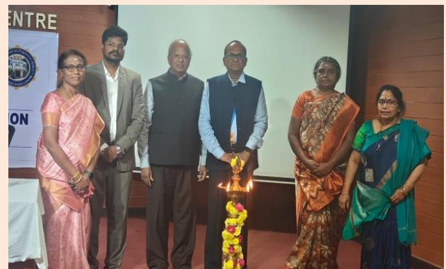
Lighting of kuthuvilakku by Dignitaries